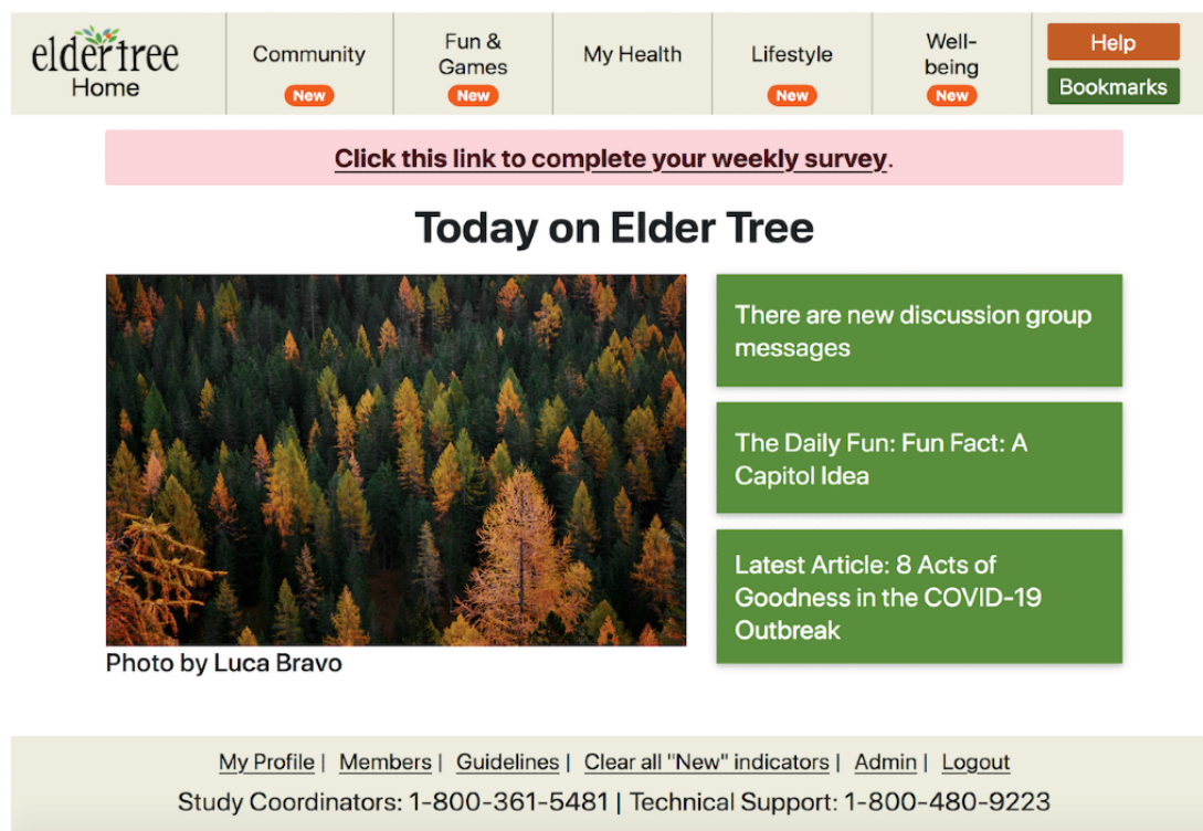
Figure 2. ElderTree homepage view.